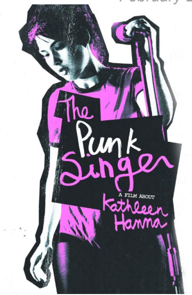
Cover of the documentary The Punk Singer

representation. Or rather, the lack thereof. The movement was aimed towards white, middle-class punk girls and this separated every other woman who didn't conform to this idea. There was never and racism nor intentional oppression against people from other races or ethnicities, but this lack of representation alienated them deeply from the rest.