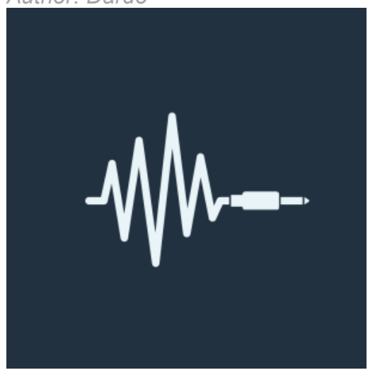
CustomForge's profile picture in all social media accounts.