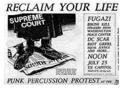
Back cover of \it Riot \, Grrrl! which advertised a concerts with band like Fugazi

inequality in Fugazi's lyrics. But, as we are going to see now, having a few allies wasn't enough when the spotlight shined on them.