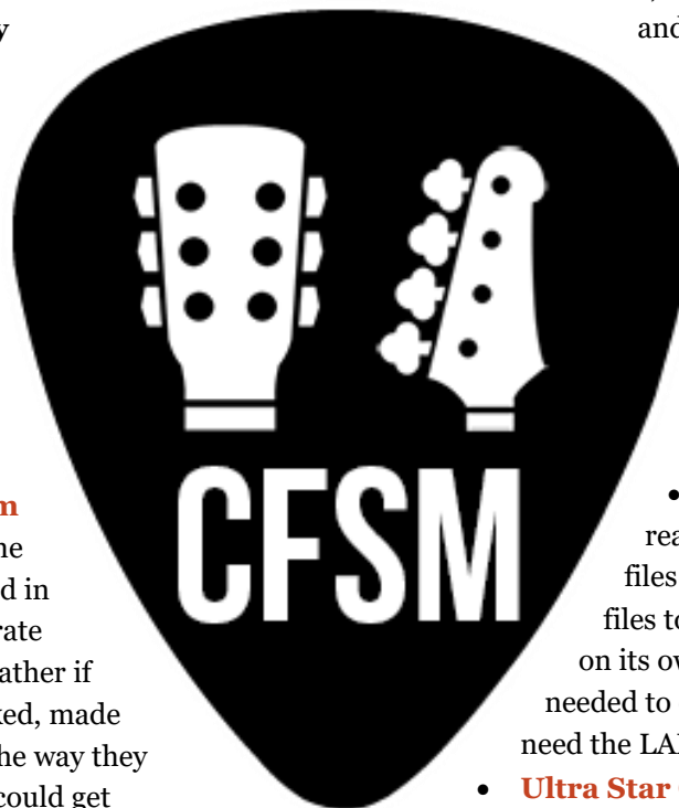
CustomsForge Song Managers' logo

To make sure we are all on the same page about the tools that will be mentioned in this article here is a summary