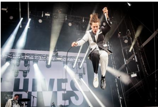
The Hives live at Lollapalooza

In order to get the perfect tone for your guitar, try setting up some distortion in the amp. If it doesn't sound like a telecaster because you can't afford one, it's okay. Try adding a lot of fuzz so you get a crunchy sound that goes well with any rock band. Be careful though, if you add too much distortion you might then decide the blast beasts are actually quite