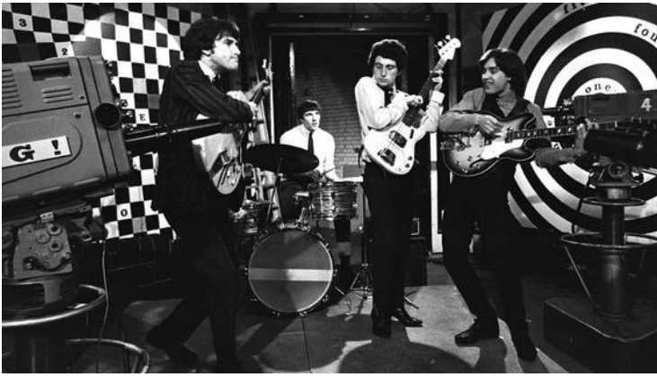
The Kinks, one of garage rock pioneers