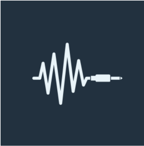
CustomForge's profile picture in all social media accounts.