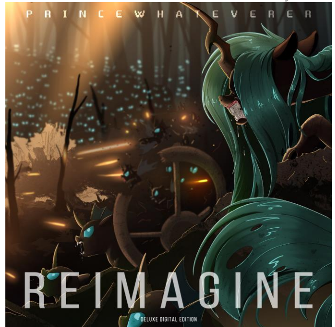
PrinceWhateverer's latest album: Reimagine