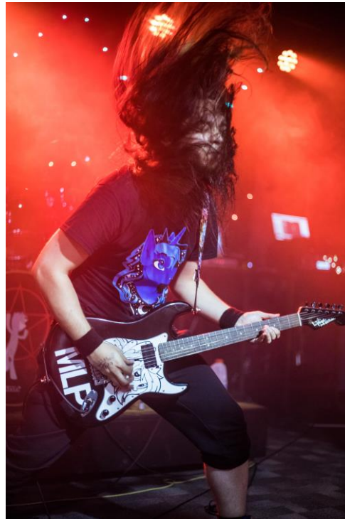
PrinceWhateverer playing live

I write the lyrics when the instrumental is finished because they are its natural conclusion. I believe that you can't write lyrics without a feeling. The instrumental gives me that feeling so I can make sure they go hand in hand. I have tried making the lyrics first but then they don't fit the instrumental. This makes real –as in not just adding a guitar or bass- collaborating hard, because lyrics and vocals take the most time and if the project is changing then that work can disappear easily.