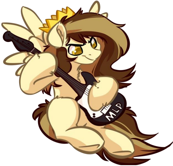
Iteration of PrinceWhateverer's avatar