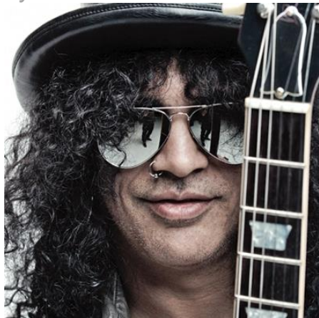
CustomForge's profile picture in all social media accounts.

Charter's tip of the month: "Instead of making a slide full of notes, make one that is continuous from the 12 th fret so the input is better" – pollo_28