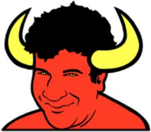
toymachinesh's profile picture