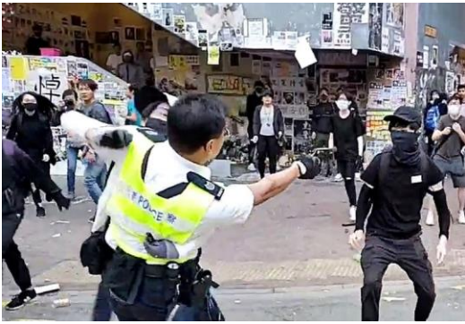
Hong Kong police shooting at point-blank range a protester

“Songs from this point of view try to attack people’s political inclinations or attract them to their cause”