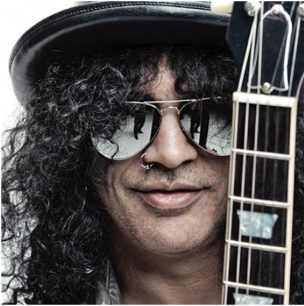
CustomForge's profile picture in all social media accounts.