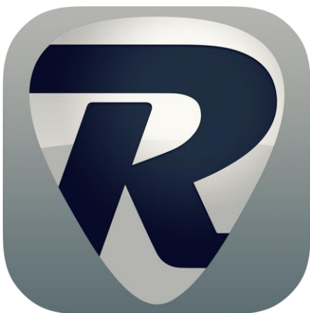
Rocksmith 2014 Remastered logo