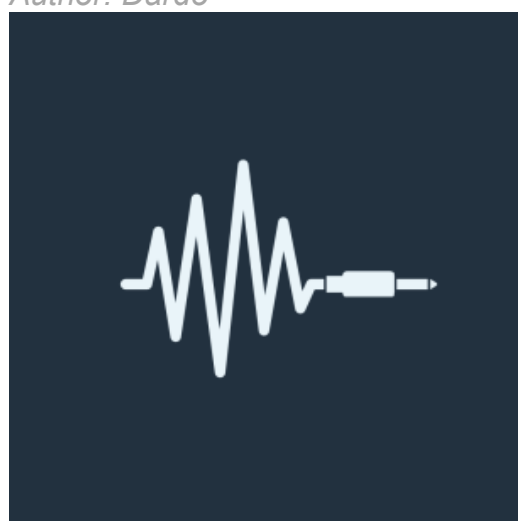
CustomForge's profile picture in all social media accounts.

Author: Dardo Editor: Unleashed2k April 2020