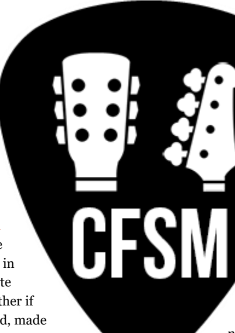
CustomsForge Song Managers' logo